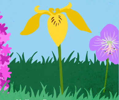
Yellow flag ( Iris pseudacorus )